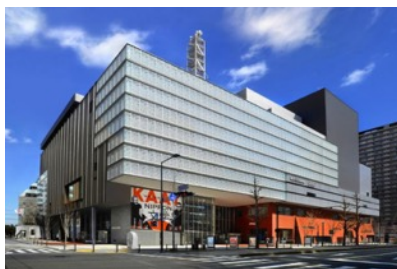
KAAT Kanagawa Arts Theatre