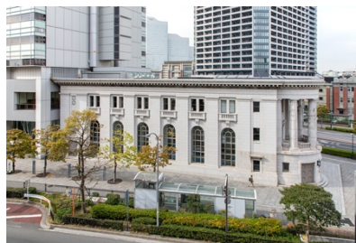
BankART Temporary (Yokohama Creativecity Center)