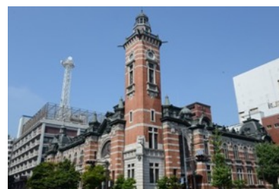
Yokohama Port Opening Memorial Hall