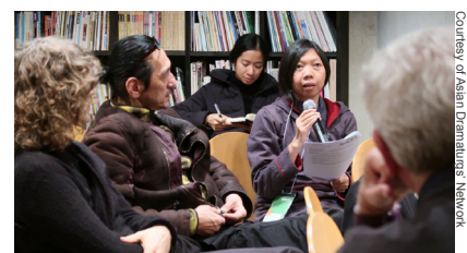
Asian Dramaturgs' Network Meeting (2017)

Professional participants can make the most of TPAM Exchange as an opportunity for promoting productions, gaining information and networking, but also general audience can participate in it except some specifically professional meetings. Asian Dramaturgs' Network comes to TPAM in continuation of the previous edition to hold a meeting entitled " Dramaturgy and the Political ," Open Network for Performing Arts Management (ON-PAM) will organize two symposia, and Yokohama Artsite that supports regional artistic activities organizes their " Artsite Lounge ." Diverse presentations and seminars including proposals by TPAM Direction directors for co-productions, talks on a project for bridging the academics and festivals as well as a new dancehouse network in Asia, and " History of Japanese Modern Theatre at the Speed of Light " by Oriza Hirata are planned to be held. Please visit the website or contact us for the latest information.