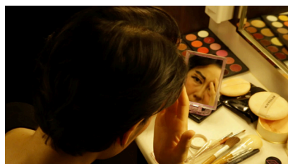
Anomalous Fantasy_Japan Version by siren eun young jung