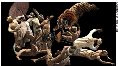
One or Several Tigers by Ho Tzu Nyen

As an international platform for professionals, TPAM seeks to introduce artists and works that promptly reflect the currents of performing arts in Asia and the world. The lineup of TPAM Direction, curated in cooperation with directors from diverse backgrounds in order to multilaterally explore the possibility of contemporary performing arts, is offered also to general audience.