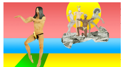
Unbearable Darkness by Choy Ka Fai

Commissions of performing arts works to artists from different backgrounds have been increasing among new art centers and festivals in Asia and Europe. This year's program focuses on conceptual, humorous and profound approaches to performing arts by visual artist, writer, DJ, band or researcher introducing such works as Canon , a durational performance by sound artist Samson Young (Hong Kong) involving a "non-lethal" sonic weapon, One or Several Tigers that explores an alternative narrative of the colonial history through video installation and shadow puppetry by filmmaker Ho Tzu Nyen (Singapore), or a concert / performance Internship where Tetsuya Umeda (Japan), who works beyond the boundaries between music, art and performance, "plays" the mechanism and resources of a theatre in collaboration with the local technical staff. TPAM believes that the lineup tells a lot about the new types of relationships that have been built between performing arts and society.