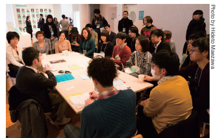
Group Meeting (TPAM Exchange)

309 official meetings and countless informal meetings took place in the previous edition. Symposia and talks on topics that bridge between performing arts and society are open also to the public (details will be announced on the website).