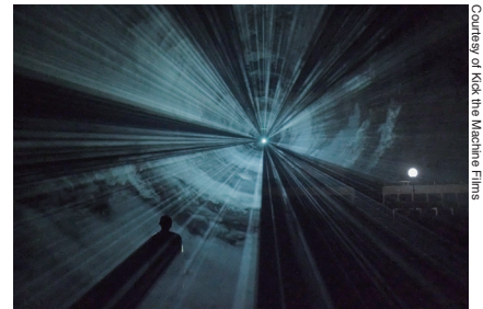
Fever Room by Apichatpong Weerasethakul

The first theatre production by the filmmaker/artist Apichatpong Weerasethakul (Thailand), who has received numerous awards including the Palme d'Or at the Cannes Film Festival, that invites the audience to reflect on the fluidity of memory and images. A completely new experience that transcends the frameworks of cinema and theatre.