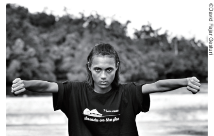
BALABALA by Eko Supriyanto

Eko Supriyanto , whose activities range from Madonna's show or choreography for Lion King to regional projects in Indonesia, reinterprets the traditional battle dance of a remote island Jailolo with five young local dancers to tackle the female gender roles in the Indonesian culture and society. The third Asian co-production that TPAM has worked on.