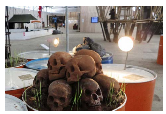
An exhibition space at Jakarta Biennale